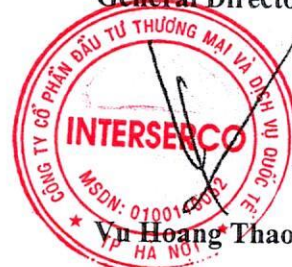
Vu Hoang Thao